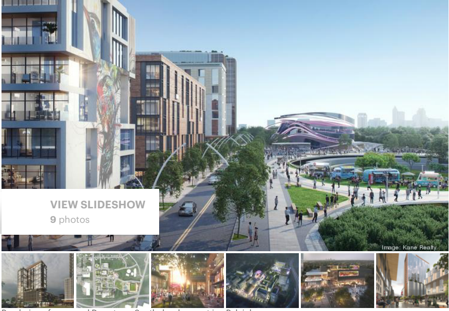
Rendering of proposed Downtown South development inn Raleigh.

Overall, the first phase of development will include 433,000 square feet of office space, 64,000 square feet of retail space, 609 multifamily units and 502 hotel rooms. Construction on this part of the project was originally set to begin in late 2021 - plans for Downtown South were first unveiled in the summer of 2019.